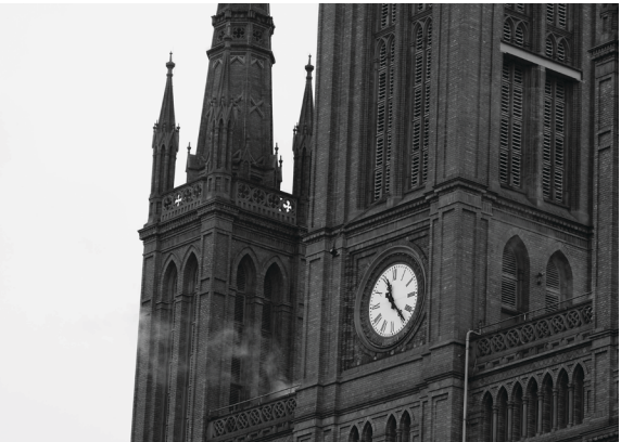
The Marktkirche stands tall in the Scholssplatz.