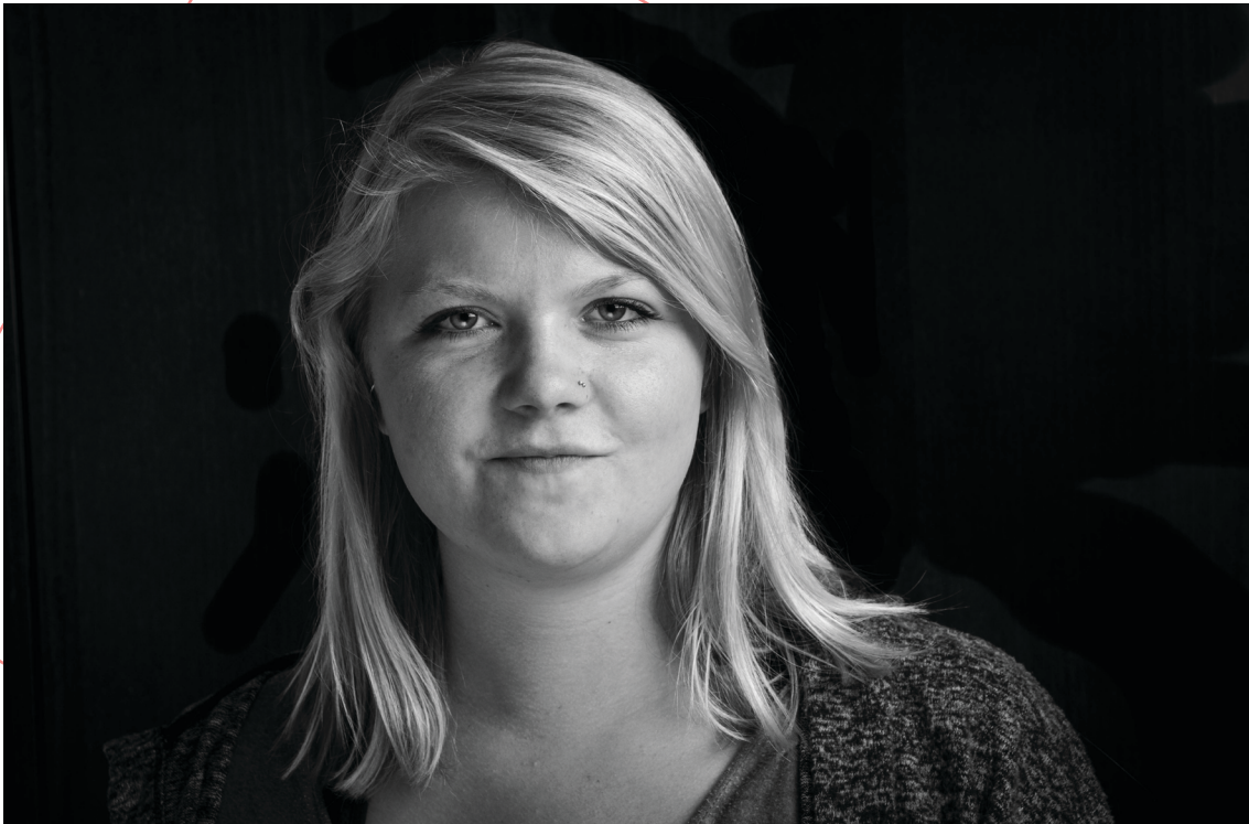
Self-portrait taken during a photography workshop at Hochschule RheinMain Media Conception and Production.

T he time has dreadfully come. Spring. Caught in between sunshine and snow, spring is my least favorite time of year. Being a native Minnesotan, I have come to love my hot summers, snowy winters, and beautiful falls. But not the spring. It's the only time of year that can be 70 degrees one day and snowy the next; not to mention the endless days of rain. Living in a time of such unpredictability creates chaos amongst my outdoor plans. Calling it annoying is an understatement. I have been living here in Wiesbaden since March and I could probably count on one hand the amount of days I've been able to wear just a t-shirt. Which isn't a huge deal or anything but I'm a huge outdoor gal so sitting inside on these chilly days has not been fun; neither has fighting the wind and rain when I actually do make it outside. I yearn for the days of sunshine and warmth when I can finally put my trench coat back in its rightful place (my suitcase) and get started on my summer tan. You may be wondering what has brought me to Wiesbaden in the first place. I have been asked that many times. Let me explain. I have always been a creative gal; more interested in the