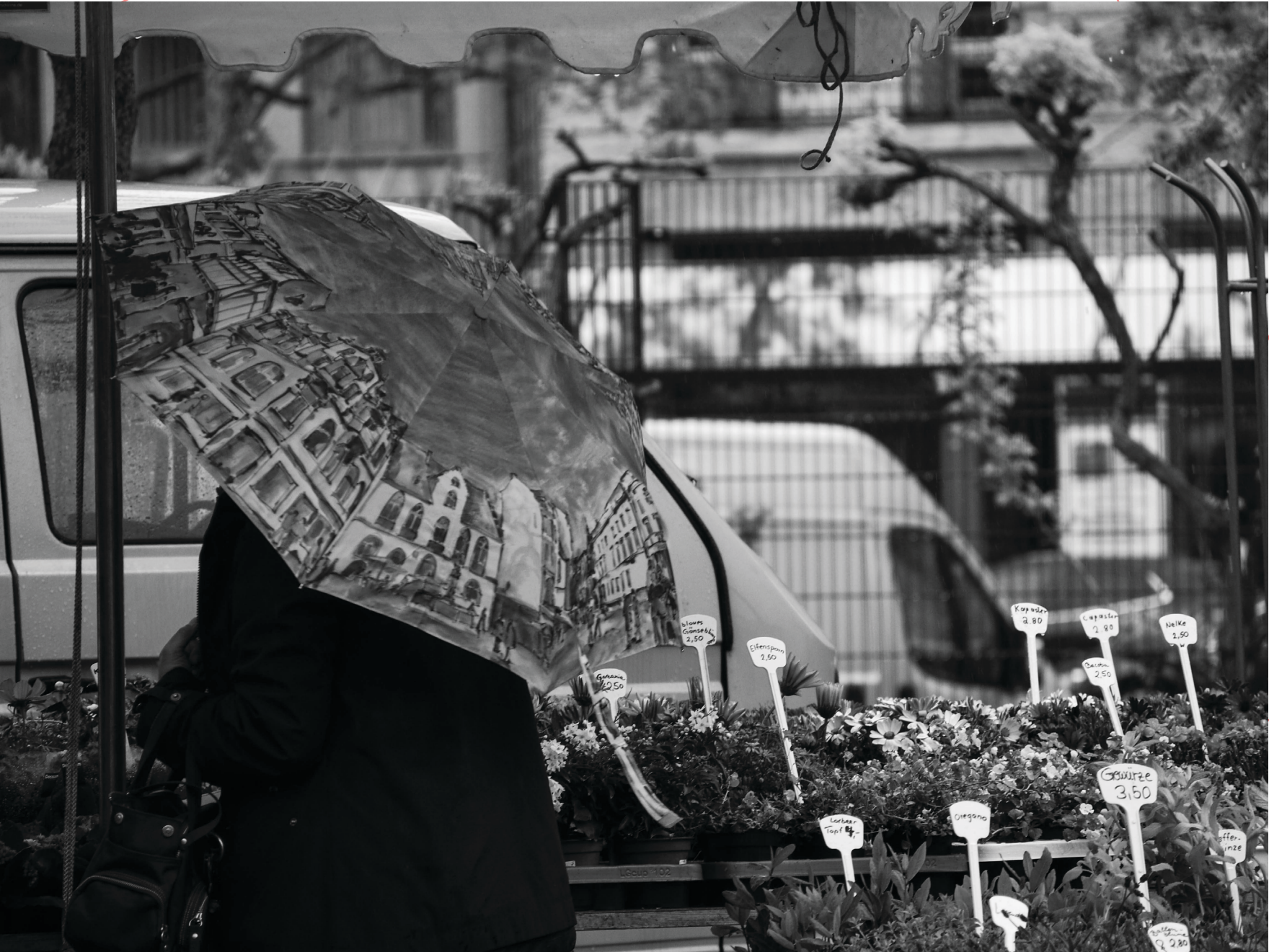
A local is found shopping amongst an array of flowers.

joyable when I want to tune out the world. The best part is there are enough buses and routes to get anywhere within the city and its outskirts. Take a bus downtown and do some shopping, find your favorite neighborhood coffeeshop, visit some historical sites, or maybe discover your new favorite restaurant on the other side of town. The possibilities are endless. On the next rainy day that you find yourself with nothing to do, hop on a bus. Have some fun. The city is your oyster.