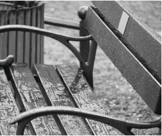
A lonely bench is photographed in Kurpark.

A great way to forgive your sins and stay out of the rain is by visiting a cathedral. The Marktkirche a perfect example. The cathedral is beautiful no matter the weather as the red brick towers through the sky; leaving its spectators in awe. I have had quite the time walking around the Marktkirche myself. When I visit on a rainy day it's even more spectacular because I can't see the top with all the rain droplets hitting my face. It somehow makes the architecture more fascinating.