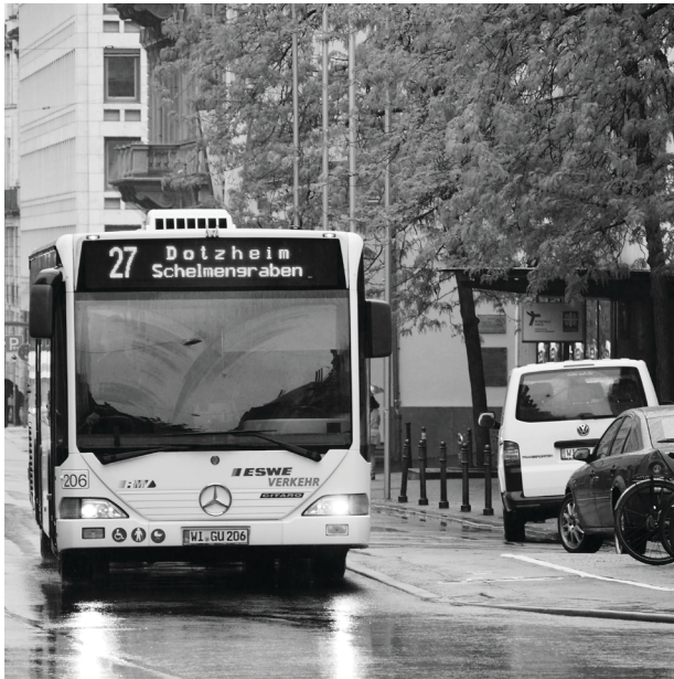
This bus, along with many others, can be found anywhere around town.